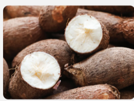
Cassava – Chips/ Powder/ Raw