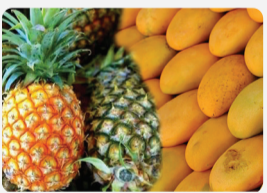
Horticulture – Pineapples, Mangoes