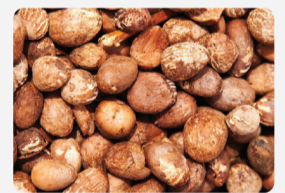
Shea – Nuts, butter, oil