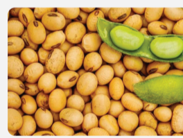
Soya beans – Processed and unprocessed