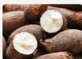
木薯 - 木薯片/粉/生木薯