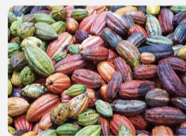
Cocoa – Chocolates, powder, butter